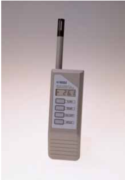
The Vaisala HUMICAP® Hand-Held Humidity and Temperature Meter HM34 provides accurate spot checks of humidity and temperature.