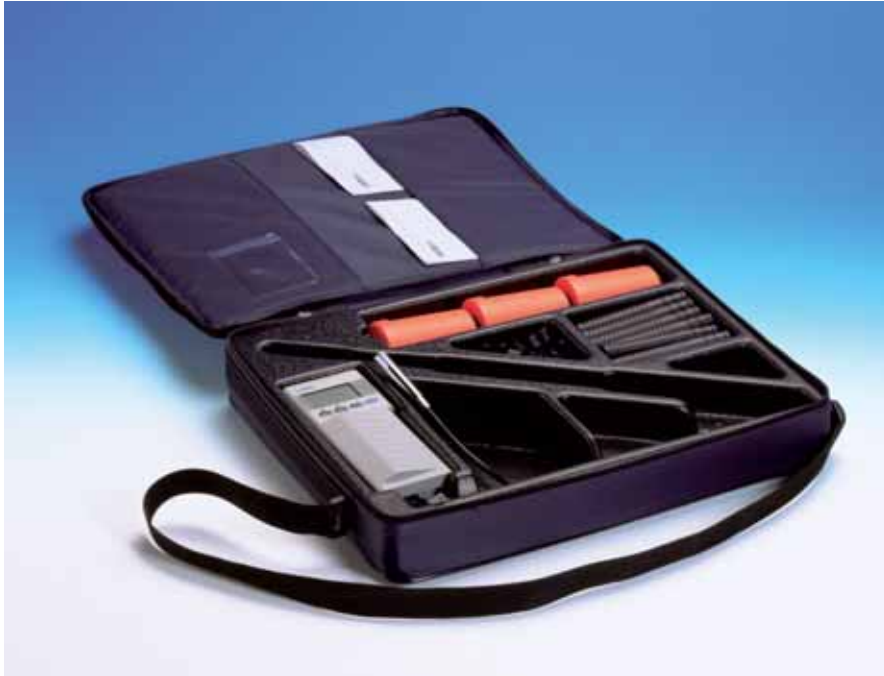
The Vaisala HUMICAP® Structural Humidity Measurement Kit HM44 provides an easy and reliable solution for humidity measurements in structural material.