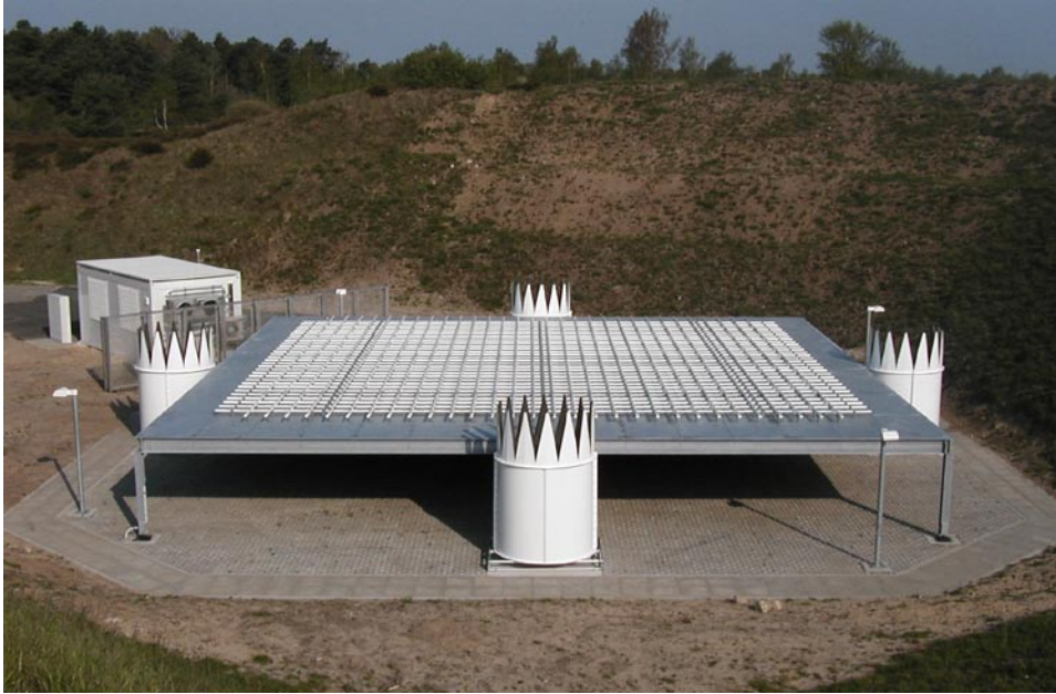
Vaisala LAP ® -16000 with RASS in Germany.