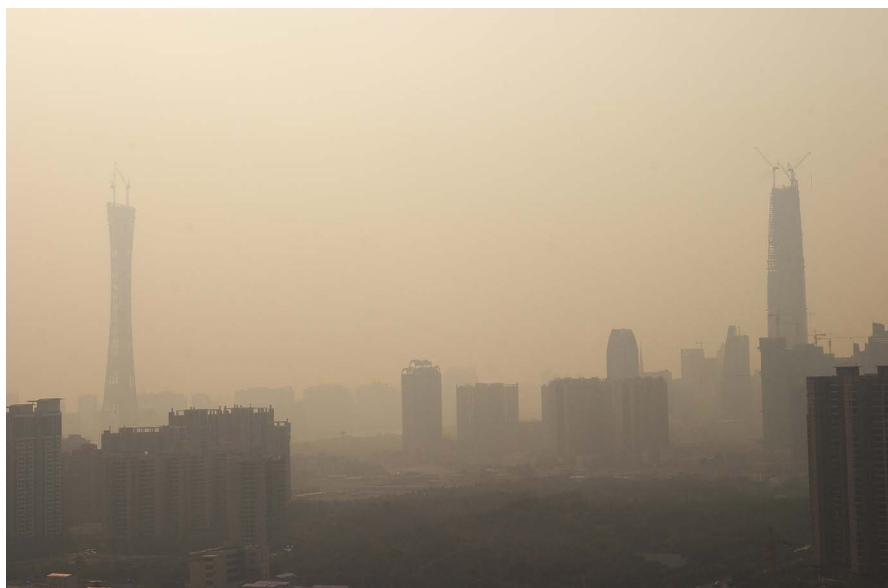
Air pollution over a city.