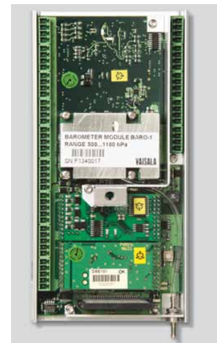
Pressure module located on the central processing unit QML201.

The pressure module is located on the QML201 CPU board. The pressure range of the sensor is 500 ... 1100 hPa and operating temperature range -40 ... +60 °C.