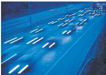
PWD12 is ideal for road weather applications.

The Vaisala Present Weather Detector PWD12 provides accurate visibility and present weather measurement in the road environment, where low visibility is a serious safety hazard and significantly reduces traffic flow rates. With a visibility measurement range of 10...2,000 meters, the Vaisala Present Weather Detector PWD12 is ideal for road weather applications. The PWD12 also indicates the cause of reduced visibility to give you a full picture of weather conditions. Its ability to detect precipitation and identify precipitation type gives the road authority valuable information for the short-range planning of road maintenance operations.