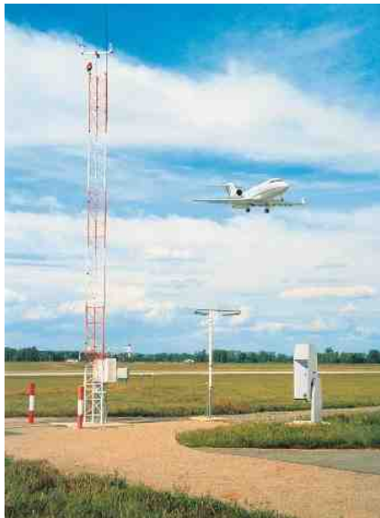
The PWD22 is recommended for Automatic Weather Observation Systems (AWOS).