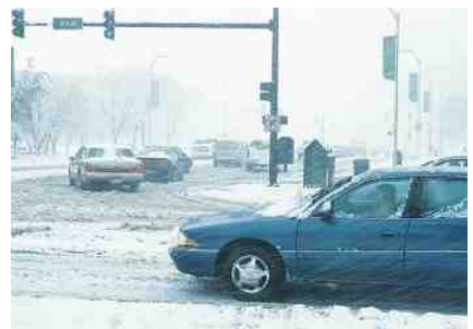
PWD-series sensors can be used in planning the road maintenance.

The PWD22 is equipped with two Vaisala RAINCAP® sensor elements to improve detection sensitivity during light precipitation events – even light drizzle is detected. The PWD22 also reports present weather in WMO METAR code format so it is easily integrated with AWOS systems.