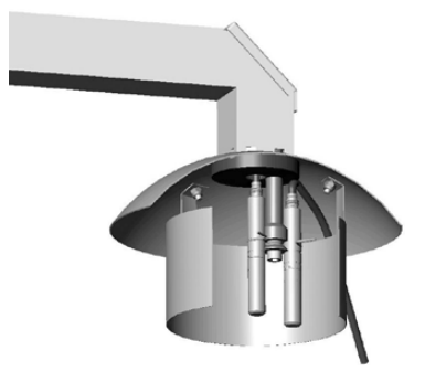
For calibration, a portable HMP77 reference probe is easy to attach beside the HMT337 probe.

Obtaining a true humidity reading is particularly important e.g. in traffic safety: at airports and at sea as well as on the roads. It is essential, for example, in fog and frost prediction.