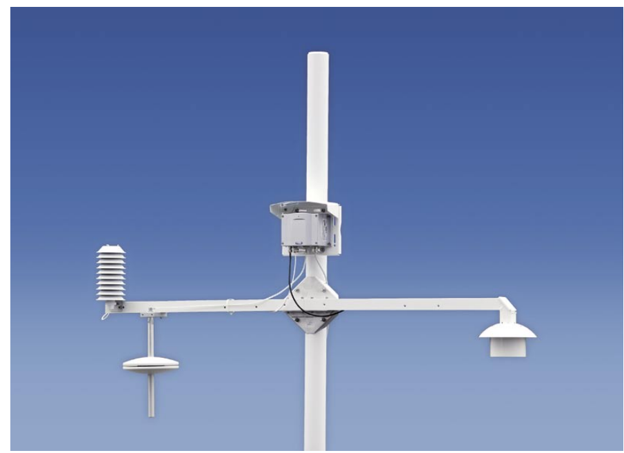
The HMT337 with warmed probe installed with the HMT330MIK kit is the right choice for reliable humidity measurement in humid weather conditions.

The Vaisala Meteorological Installation Kit HMT330MIK enables the Vaisala HUMICAP<sup>®</sup> Humidity and Temperature Transmitter HMT337 to be installed outdoors to obtain reliable measurements for meteorological purposes.