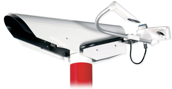
The integrated forward scatter sensor.

The Vaisala patented automatic calibration method for transmissometers is based on an integrated forward scatter sensor/present weather sensor. The system automatically detects drift and adjusts the sensor settings accordingly. Weather conditions do not need to be as good as for manual calibration; the LT31 automatically recognizes suitable conditions.