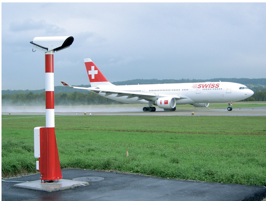
The Vaisala Transmissometer LT31 enables the accurate and reliable single baseline measurement for CAT IIIb category airports.

The LT31 incorporates a white LED as a light source. White light is needed for the best accuracy in transmittance measurement. The WMO recommends the use of a wide spectrum (white) light sources for transmissometers as narrow spectrum light source (e.g. lasers or colored LEDs) will cause measurement error with some weather phenomena.