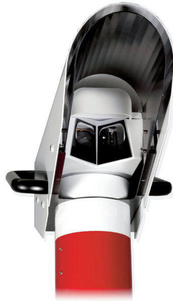
True window contamination compensation based on V-shaped windows.

The LT31 can be equipped with an internal back-up battery. This feature provides steady data availability during short power breaks, e.g. while back-up generators are started.